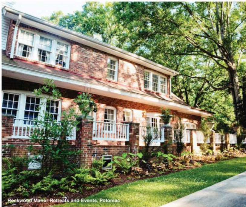
Rockwood Manor Retreats and Events, Potomac

Rockwood Manor also provides custom retreat packages for businesses, with a variety of guest houses and cabins that can house a maximum of eight to 20 guests.