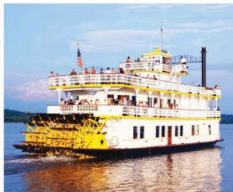
From left: Lockhouse 22 at Pennyfield Lock, Montgomery County; Cherry Blossom riverboat from Potomac Riverboat Company, an Entertainment Cruises operation

Another option for nautical gatherings, Spirit of