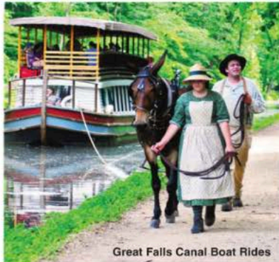
Great Falls Canal Boat Rides