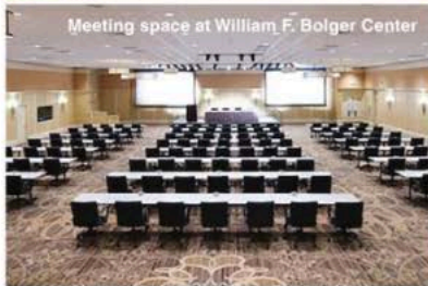
Meeting space at William F. Bolger Center