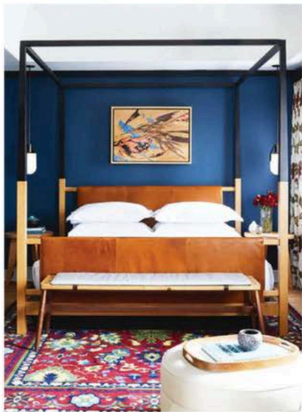
From top left: Lobby at Crowne Plaza Baltimore–Inner Harbor; poolside at Sagamore Pendry Baltimore; guest room at Hotel Revival, Baltimore

lecture-style meetings or seminars. The Greenhouse Classroom holds 100 theater-style and 75 for dinner.