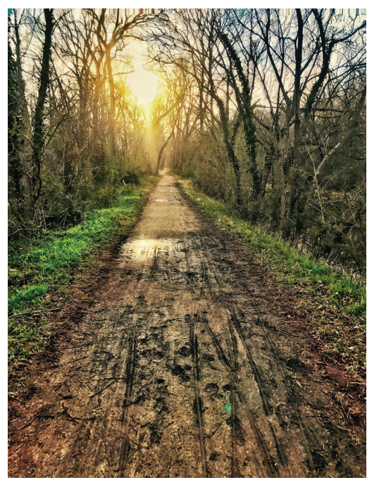
Left: The breach at Mile 52.5 near Brunswick. Above: With your support, a muddy towpath full of ruts will be a thing of the past!